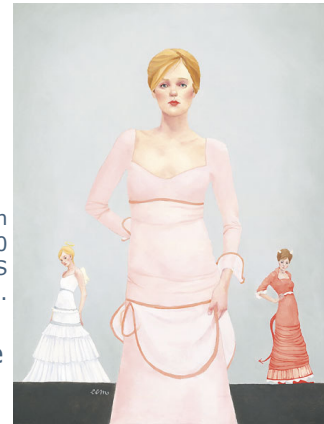
Image size: 9"w x 12" h Edition size: 100 Limited edition canvas - $195 US ©Emily McPhie, ©The Greenwich Workshop, Inc.

The Greenwich Workshop SmallWorks art is now featuring in the Spring 2008 collection. Each of the 40 pieces in the 2008 SmallWorks collection measures 144 square inches or less. They make wonderful art work for table tops, niche areas, in combination with other art - possibilities are endless.